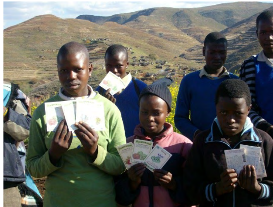
High Mowing Organic Seeds of Wolcott, Vermont gave over 700 packets of seeds to orphans, families and support groups to start gardens!