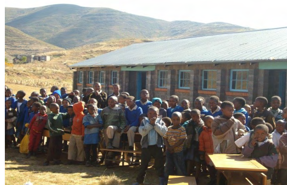
Right: The entire student body of Montsi School (about 200 children) stands outside for morning prayer. More than half of these students are double orphans coming from child-headed households. →