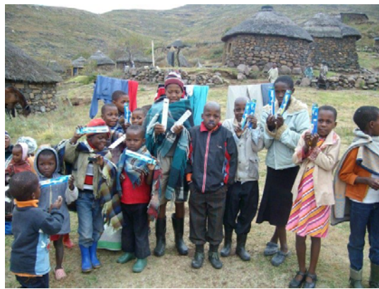
Middle Schoolers from Georgia, Vermont donated medical supplies, toys, and these fun home-made masks!