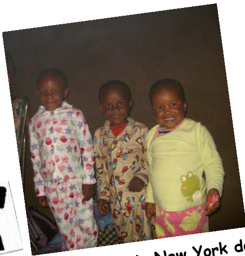
Pajama Program in New York donated warm PJs for the HIV Children's Clinic